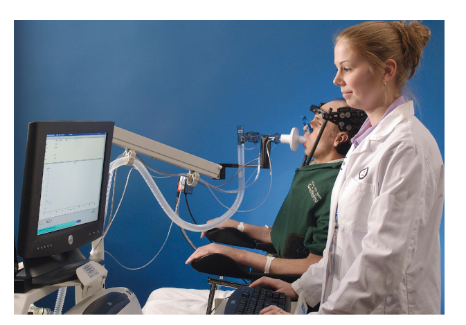
Patients in need of ventilator weaning and tracheostomy support services receive around-the-clock care.

The state-of-the-are ReWalk™ Exoskeleton combines robotics with human assistance to make walking possible.