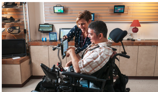
Specialized therapists work in a wide range of assistive technologies and excel in working with clients to design an integrated approach to best meet multiple needs.

From sailing to cycling, golf to gardening, the Adapted Sports and Recreation Program has offerings for individuals of all ages. Preregistration is required for all activities.