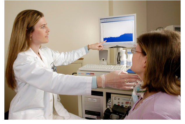
Our Speech Language Pathology Services provide therapy to improve communication skills and swallowing abilities using state-of-the-art technology.

At Helen Hayes Hospital everyone is treated with dignity, respect, and compassion.