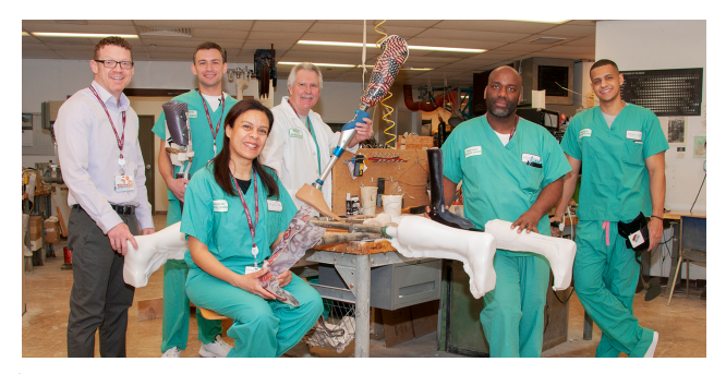
Our on-site Prosthetic Orthotic Center provides evaluation, fabrication, and adjustment services for artificial limbs and other prosthetic and orthotic devices.