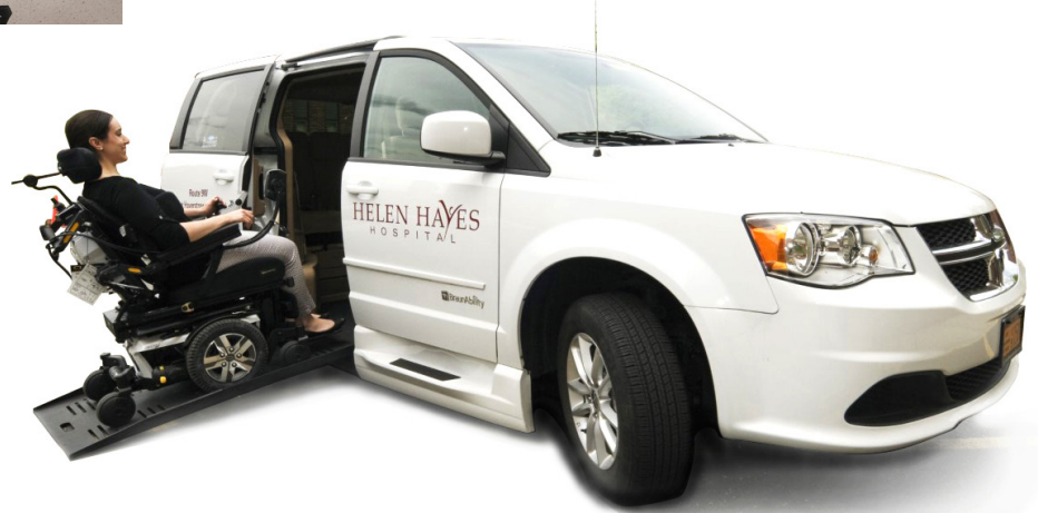
The Adapted Driving Program is home to a state-of-the-art adaptive driving evaluation van, which includes a power lift and wheelchair lockdown.

Wellness Center. A professionally supervised, fully accessible, exercise facility. Call 845-786-4194.